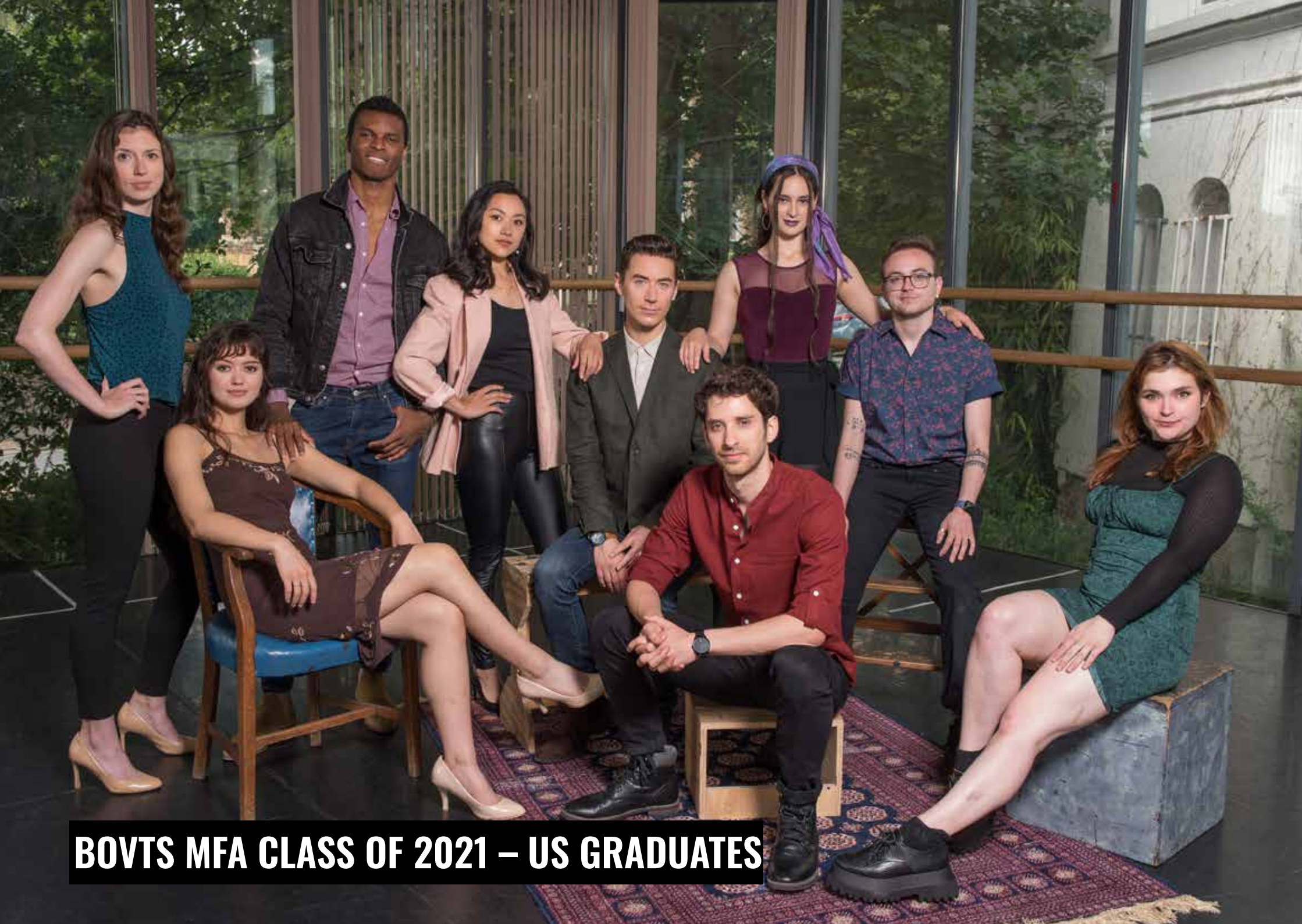
BOVTS MFA CLASS OF 2021 – US GRADUATES